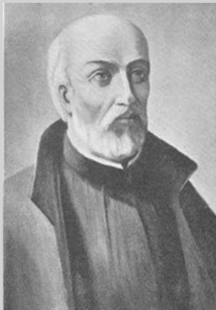
St. John de Brebeuf